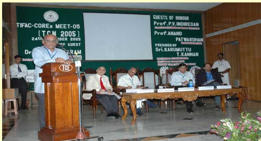
Dr.R.Chidambaram, Chairman, TIFAC & Principal Scientific Adviser to the Government of India giving the Inaugural Address to the gathering on the occasion of the TIFAC COREs MEET -2005