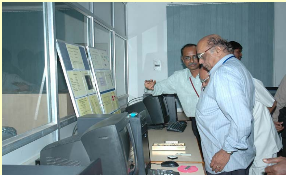
Dr.R. Chidambaram, Chairman, TIFAC visited the RFSystems Lab, TIFAC CORE during the TCM -2005 inaugural occasion.