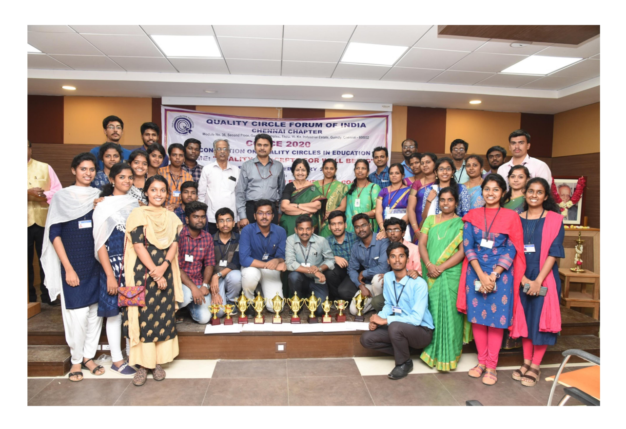
TCE QC TEAM at CCQCE 2020

Five student teams and two staff teams from TCE participated in the Case Study Presentation