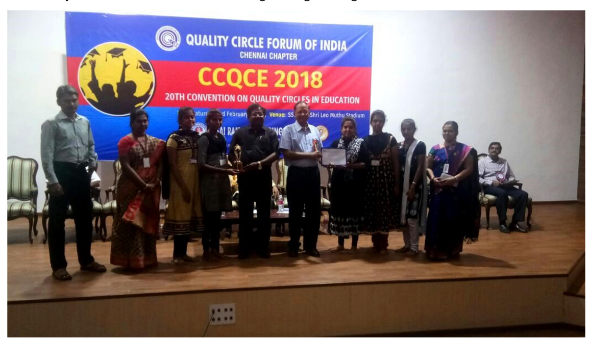
Case Study Title: Decrease in Pass Percentage in Engineering Mathematics II - Par Excellence Award