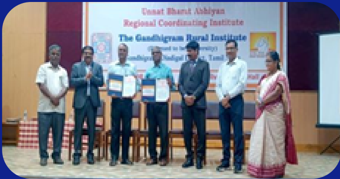
MoU with Gandhigram Rural Institute, Gandhigram