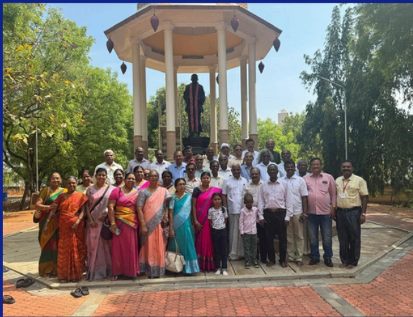
1985 Batch Reunion

The alumni from the class of 1985 gathered at TCE on May 11, 2024, for a heartwarming reunion. It was a day filled with laughter and reminiscing as they celebrated their treasured memories together.