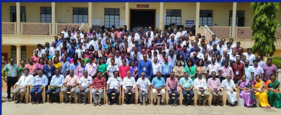
1998 Batch Reunion

The alumni from the class of 1985 gathered at TCE on May 11, 2024, for a heartwarming reunion. It was a day filled with laughter and reminiscing as they celebrated their treasured memories together.