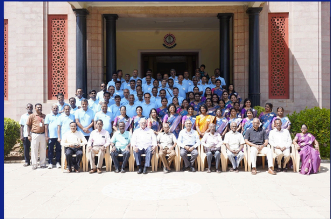
1995 Batch Reunion

The alumni of the class of 1995 batch gathered for a heartwarming reunion from June 28, 2024, at TCE. Filled with laughter and reminiscence, they celebrated their cherished memories