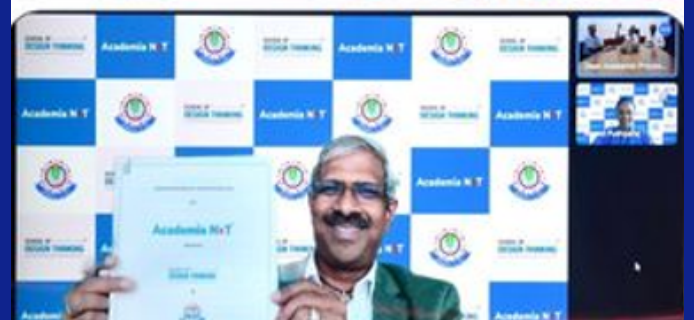
MOU with the School of Design Thinking (SODT)