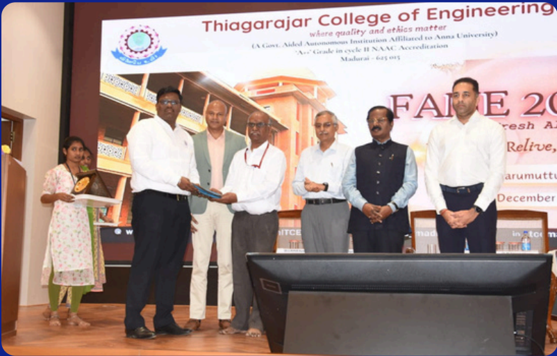
Felicitation of Outstanding Alumni Award Recipients